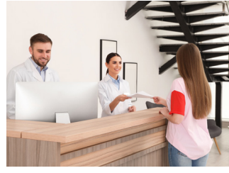
Hospitals & Clinics